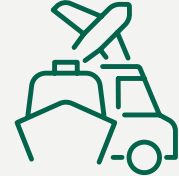
Transport and Distribution